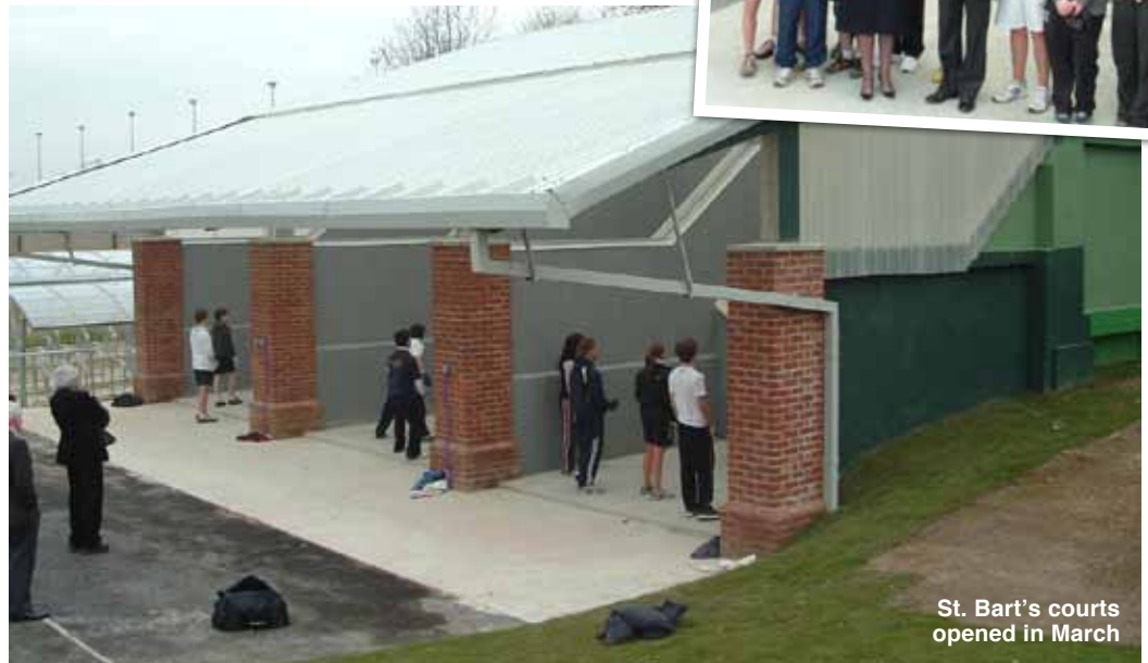
St. Bart's courts opened in March

Our game cannot survive without courts, so the Federation has great delight in reporting that, all over the UK, new courts are being built and existing courts are being refurbished.