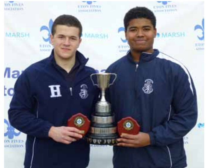
Harrow's Open title was the first for the school in 13 years

The 2013 Marsh National Schools' Championships took place this year at Shrewsbury, with a large number of boys and girls taking part.