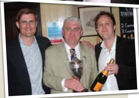
Stringer and Worth (top); The Old Millhillians (below)