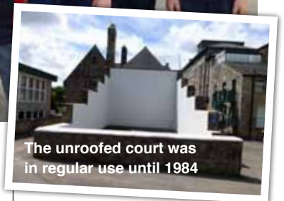
The unroofed court was in regular use until 1984

Fives formed a major part of celebrations to mark the 400th anniversary of Heversham Grammar School.