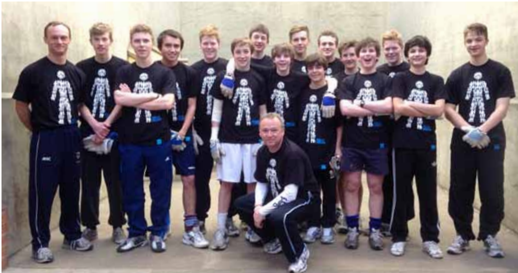
The staff and pupils of Eton raised over £3600 for Prostate Cancer UK and Thames Hospice Care