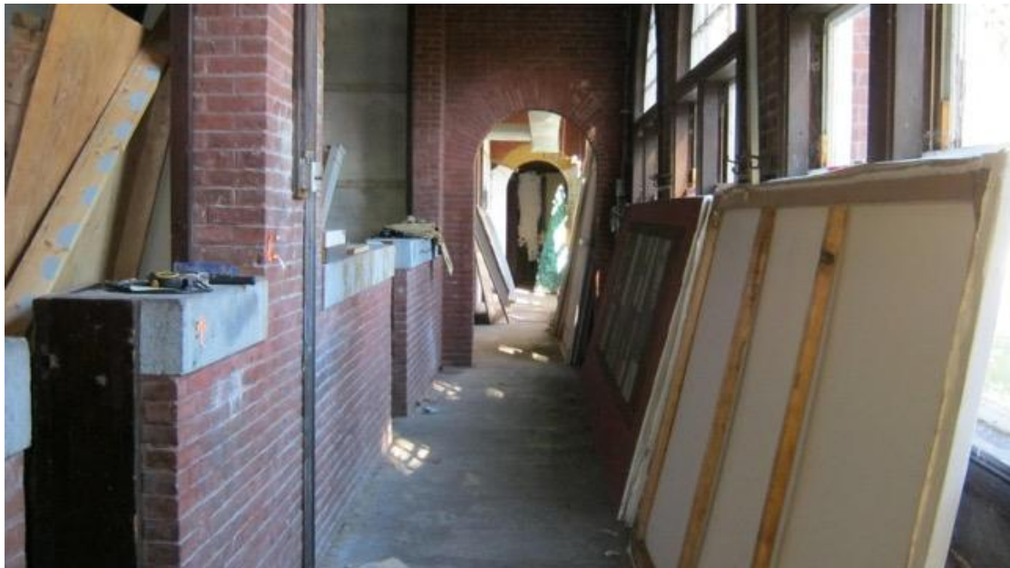
Groton courts in alternative use!

Alternative uses for a Fives court USA-style – prop storage, ice hockey practice and softball practice.