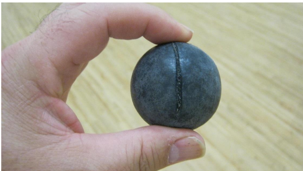
Black-stained Cliff ball for use at the Boston Union Fives Club