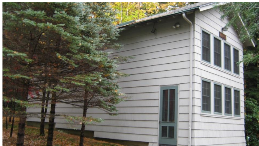
Maine court 2016