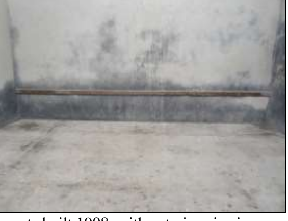
Giggleswick School, Yorkshire. 2 non-standard courts built 1908, with exterior viewing. Used to host the Yorkshire Open Championships.