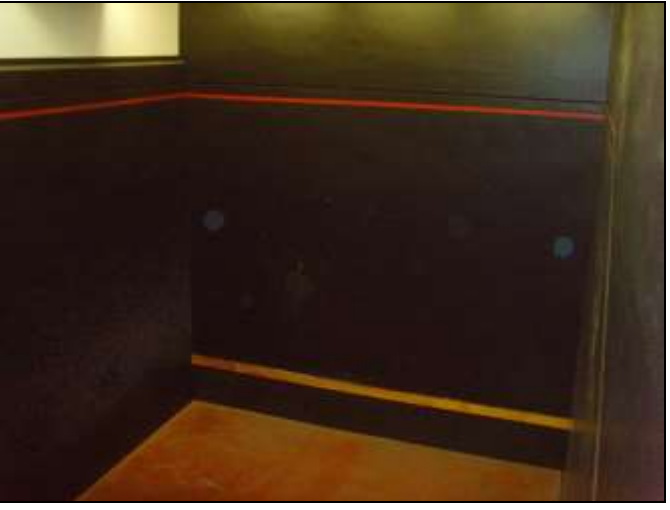
St Paul's School, London SW13. 6 standard indoor courts in a row, built 1968, with spectator gallery. Home to several national and regional tournaments including the National Singles.