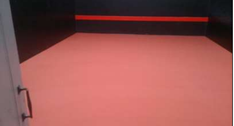
Alleyn's School, London SE22. 4 standard indoor courts, from 1934 & 1961, back-to-back, enclosed 2010. Used for National Doubles and National Mixed Doubles among others.