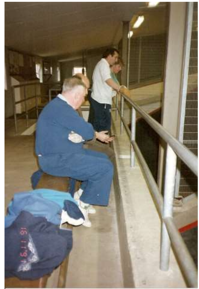
Christ's Hospital, Sussex. 4 indoor courts, built 1965, back-to-back, with viewing gallery. Used for various competitions, including the South East Open Championship.