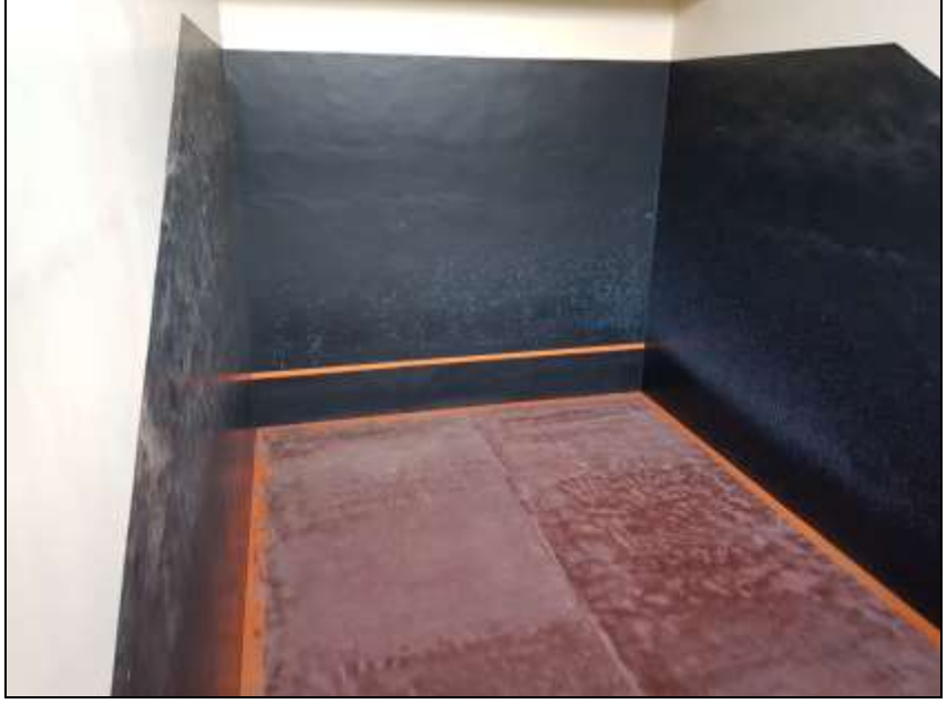
University Sports Ground, Durham. 2 indoor courts, built 1957, with viewing gallery. Used for North of England Open and Northern Schools Championships among others.