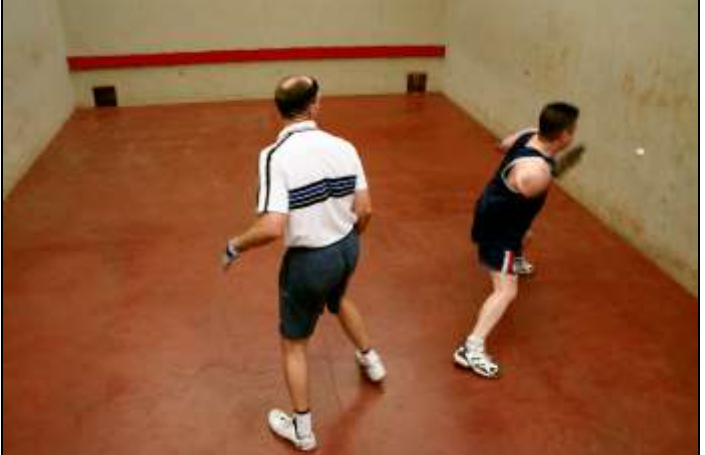
Blundell's School, Devon. 6 standard covered courts, back-to-back, with outdoor viewing, built 1963. Used for the South West Open in July.