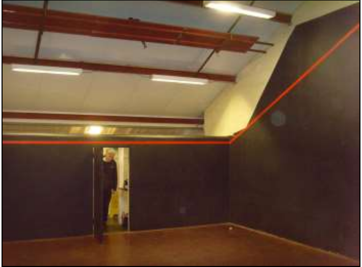
Sherborne School, Dorset. 5 indoor courts in a row, much altered since 1874, refurbished 2001. Used for West of England Championships among others.