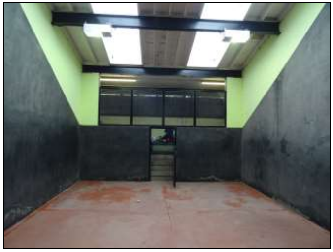
Loretto School, Musselburgh. 3 indoor courts built 1914 and 1964 with indoor viewing. Used for the Scottish Open Championships.

Other courts around the country that have been used on occasion, or could be, for tournaments of various kinds: