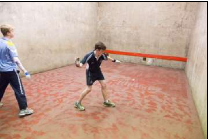
Marlborough College, Wiltshire. 4 indoor courts in a row, built 1929, enclosed 2000. Used for National Schoolgirls' Championships and various open tournaments.