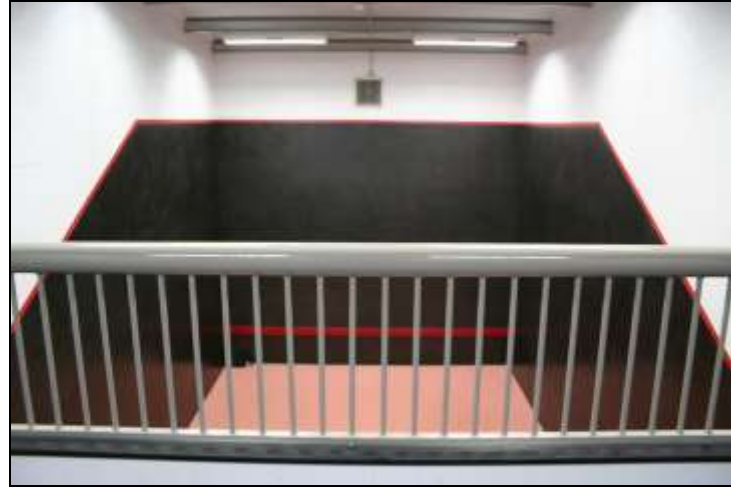
Oundle School, Northants. 4 standard courts, built 2007, back-to-back with central access and gallery. Used for National U25 Championships among others.