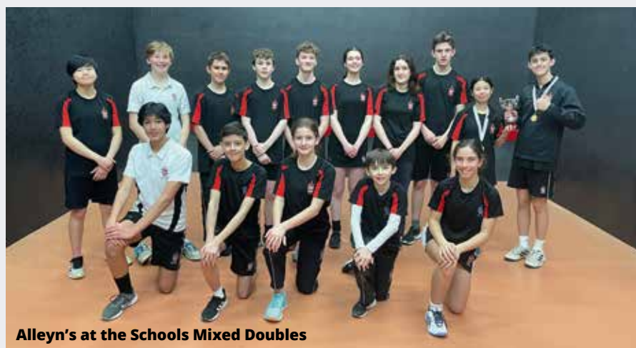
Alleyn's at the Schools Mixed Doubles

Finally mention should be made of a wonderful morning in March when Alleyn's Fives communities past and present came together: students, AOBs and AOGs, members of the RFA and present staff played and watched Fives, then – over lunch – socialized, reminisced and looked ahead. We hope this gathering will become an annual event.