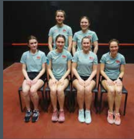
Eight victories in a row for the Cambridge Women