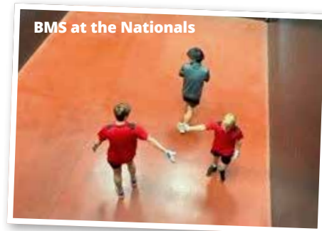
BMS at the Nationals