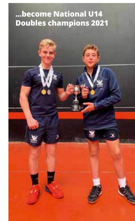
...become National U14 Doubles champions 2021