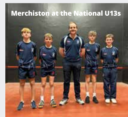
Merchiston at the National U13s