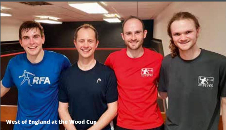
West of England at the Wood Cup