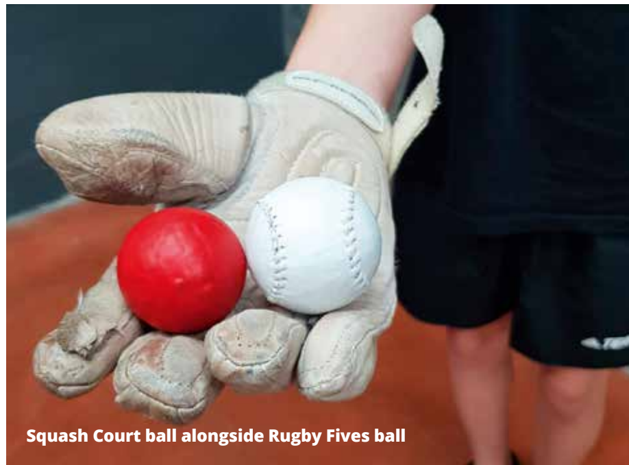
Squash Court ball alongside Rugby Fives ball

Developments in the promotion of Squash Court Fives