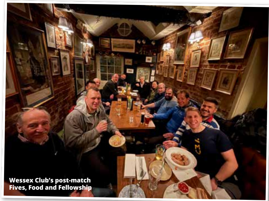
Wessex Club's post-match Fives, Food and Fellowship