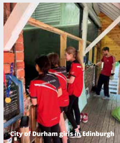
City of Durham girls in Edinburgh