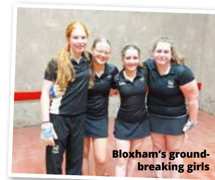
Bloxham's ground-breaking girls