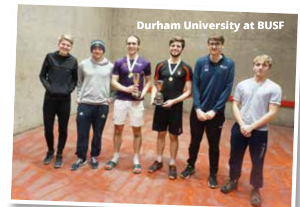
Durham University at BUSF