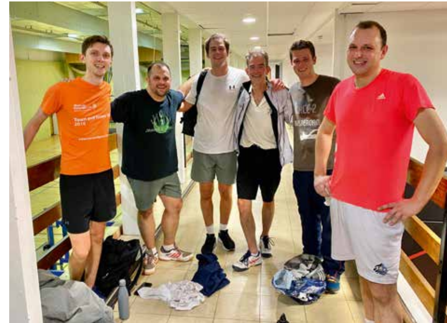
The RFA Club's season started with a match against the Jesters