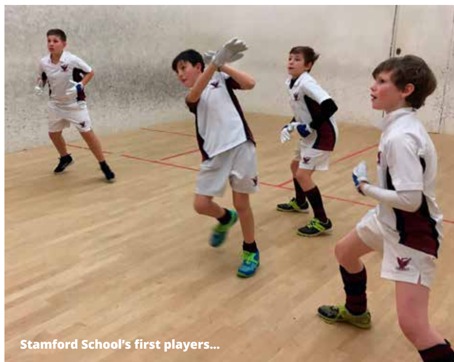
Stamford School's first players...