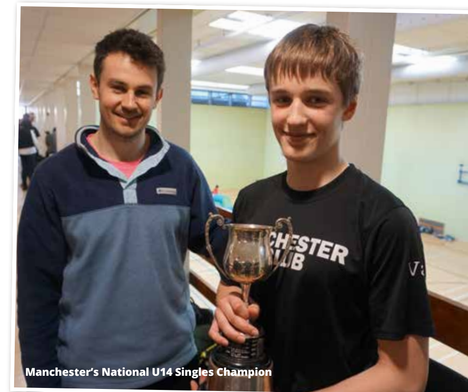
Manchester's National U14 Singles Champion

super for the club. We are particularly busy with Beginners' Night, when we sometimes have as many as 14 players on court. We have approached a local Scout/Cub group, suggesting they participate to achieve their Physical Recreation badge and thereby introduce them to the game of Fives – one to watch. And Junior Y on Saturdays is still going, though we always need to encourage more children to come down and take part.