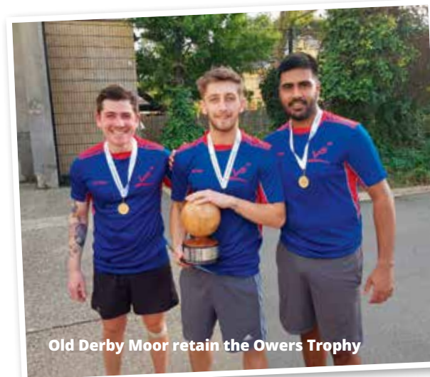
Old Derby Moor retain the Owers Trophy