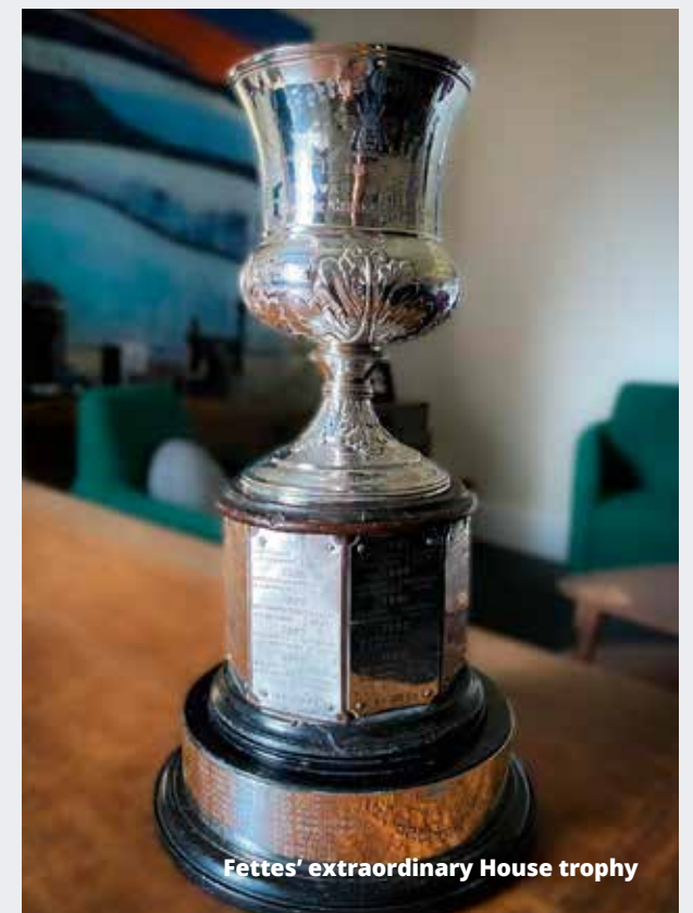
Fettes' extraordinary House trophy