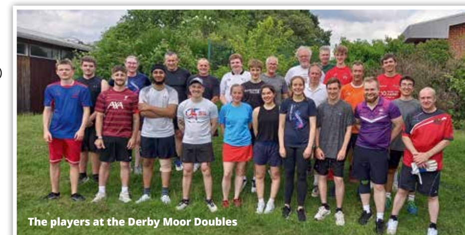
The players at the Derby Moor Doubles