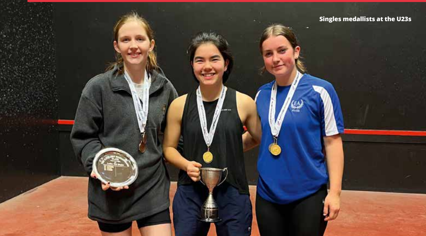
Singles medallists at the U23s