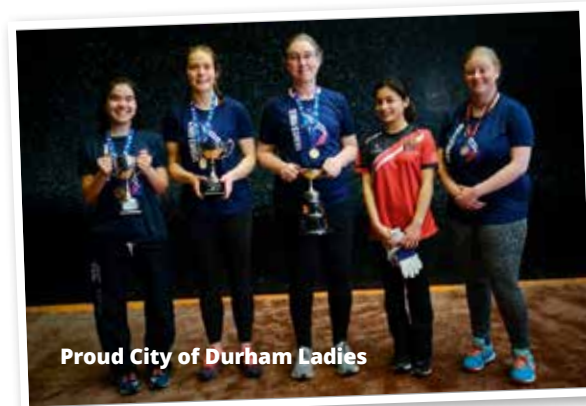
Proud City of Durham Ladies

England Open. He again played well against strong opposition, rounding off a super first season for the club; we're all excited to see what he can achieve next year and beyond.