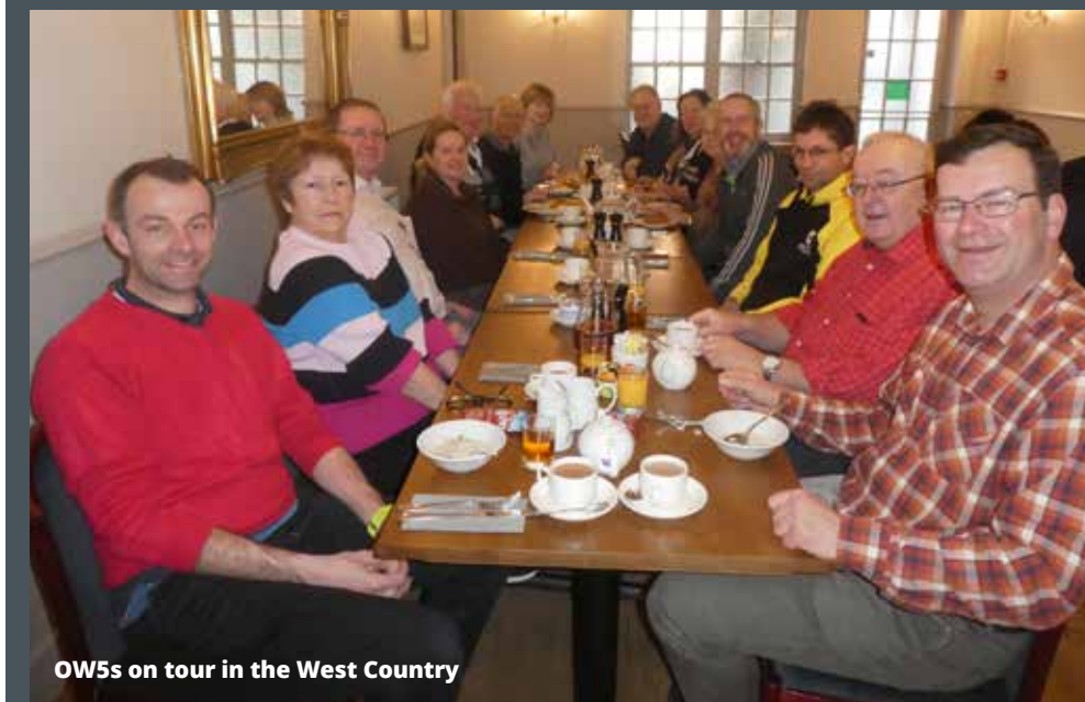
OW5s on tour in the West Country