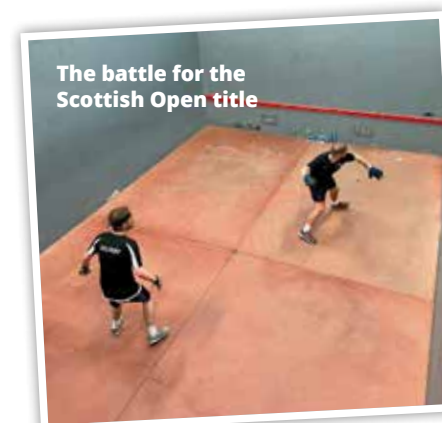
The battle for the Scottish Open title