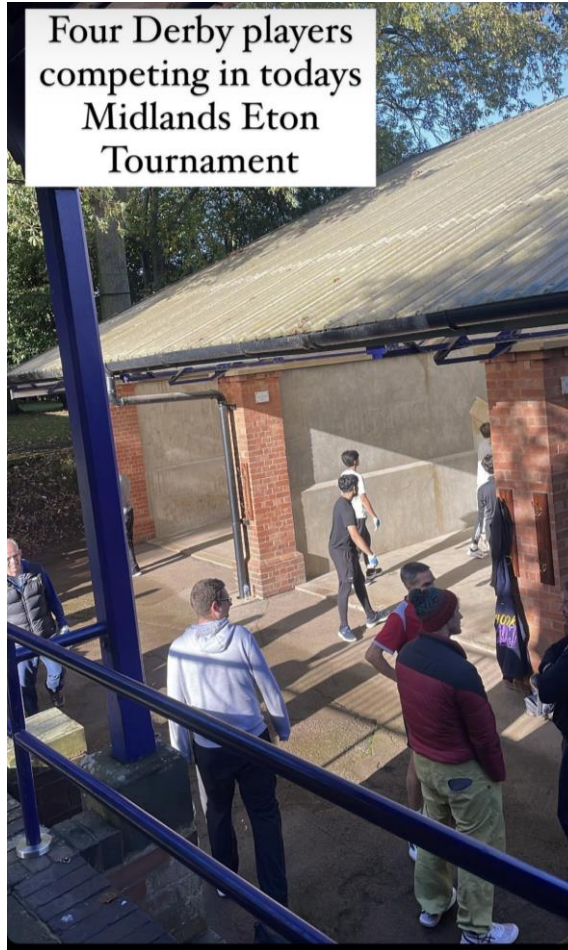
Four Derby players competing in today's Midlands Eton Tournament