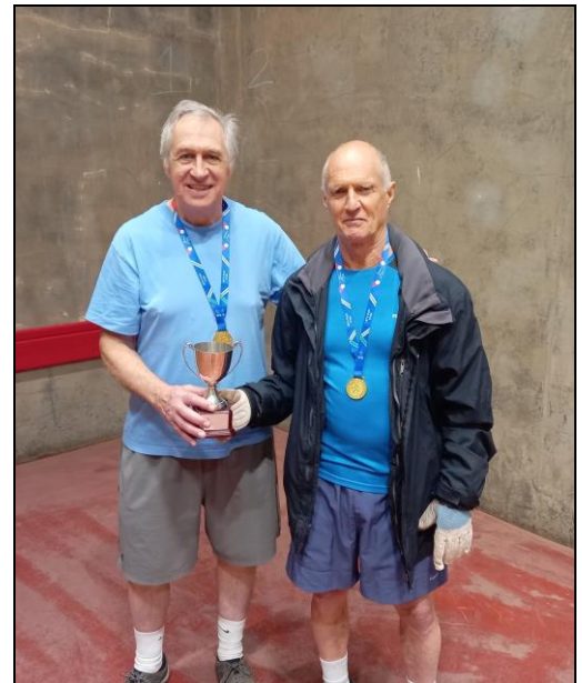
5 in a row in 2023