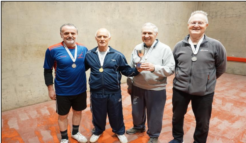
After a break for covid -- the 4 th title in 2022