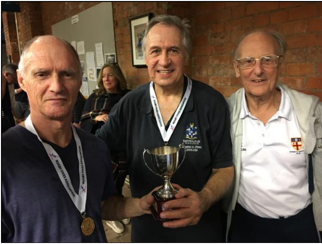
2018 Title number 2