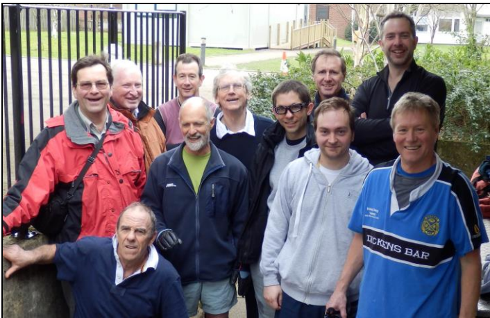
On tour at Tiverton with the Old Whitgiftians 2016