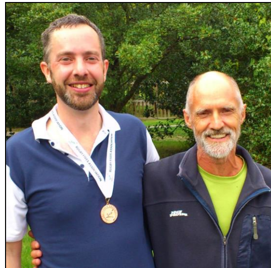
The stalwart Old Whitgiftian